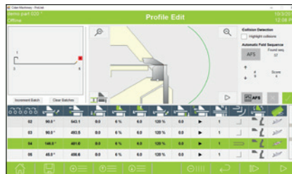
This function automatically calculates bending sequence, analyses possible collisions and provides information in graphic display for the operator.